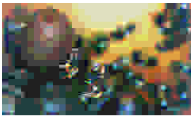
Figure 2 . Storage pots in a nest of Melipona . Details of storage pots for honey and pollen.

In contrast to the honeybee, where the queen exerts pheromonal and behavioural control over worker reproduction, most stingless bees have laying workers which commonly feed the queen by laying trophic worker eggs. Recently a number of articles have concentrated on the contribution that workers make to the production of males by the laying