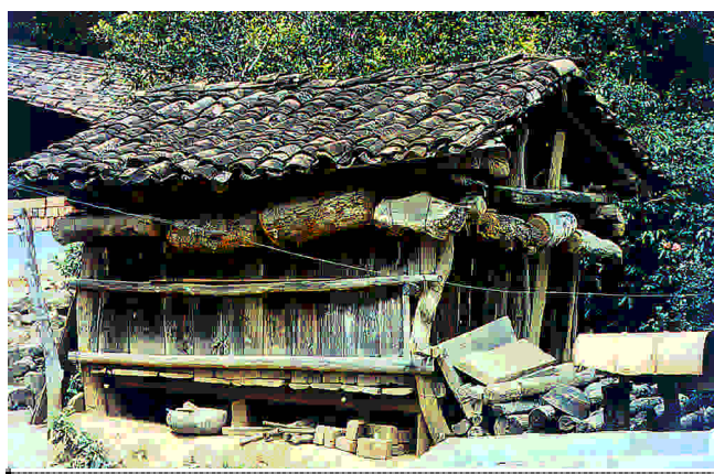
Figure 1 . Traditional stingless beekeeping in Central America (El Salvador). The hives consist of hollow tree-trunks in which the nests had been found in the forest. The hives are generally suspended under the eaves of the houses. Both ends of the hives are closed with stoppers that can be removed for the harvest.

Stingless bees have been used by man for many centuries. In the American tropics a well-developed system of bee-keeping for the production of honey and wax was practised by the ancient Maya cultures of Mesoamerica. Today, in Yucatán, Mexico, remnants of this once very important tradition still prevail. All over Central America stingless bees, mainly the large-sized Melipona species, are still kept by rural people (figure 1). In the Amazonian region the traditional use of stingless bees is characterised by sophisticated systems of 'honey hunting' which can include the 'management' of colonies in their natural nesting sites. Over the last few decades applied research and fundamental biological studies have led to various activities and projects being focused on this very interesting group of bees.