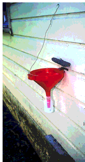
Figure 5 . Method for catching the nest-departing non-accepted gynes: Funnel with bottle for collecting departing wing-clipped gynes placed under the exit of an observation hive. Methode voor het onderschepjen van de nestverlatende niet-geaccepteerde maagdelijke koninginnen. Met een trechter en een opvangflesje worden de vleugelgeknipte jonge koninginnen die uit het nest willen vliegen opgevangen.

was recorded simultaneously by a second observer outside the laboratory. The results of the observation of nuptial flights are listed in table 2. Virgin queens undertook their nuptial flight between 10:01 and 13:08 h. three to seven days after their acceptance. They returned after one and a half to eight minutes. Upon inspection of the brood after 45 days we found that all colonies contained female offspring, which confirmed that all gynes had been inseminated. None of the returned gynes left the hive for a second time and they were never seen in the entrance tube again. From the duration of the flight we estimated that nuptial flight ranges could not have been much longer than 350-1500 metres.